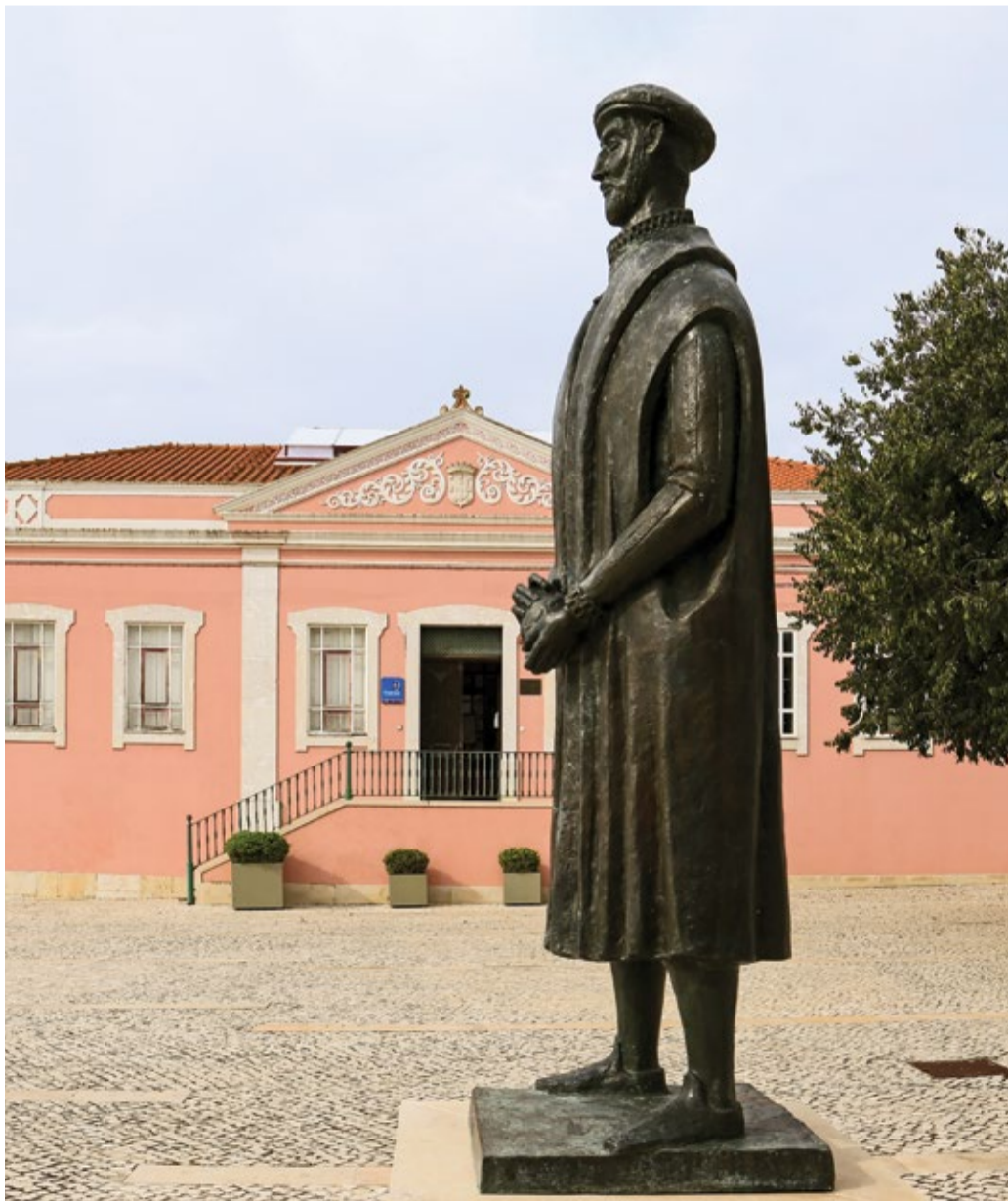
Statue of Pedro Nunes, in the square with his name

Once in a while, a galleon sails up the river, inviting people to discover Alcácer do Sal through the eyes of those who transported salt from here to other places. Originally built in 1946, the “Pinto Luísa” is a symbol of a local culture that became one of the economic drivers of this coastal region. The old salt galleon, which can carry up to 50 people, allows passengers to discover the local fauna and flora, while learning more about the importance of preserving habitats. The dates of the next tours are as follows: 23 July, 5 and 27 August and 9 September. Departures are from the quay, on the south bank of Alcácer do Sal. Reservations are required (contact the tourism office: Tel. 265 610 040 or turismoalcacer@m-alcacerdosal.pt ).